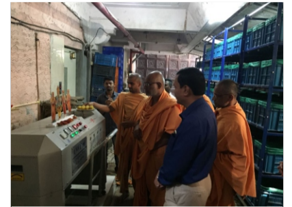
Composting Machine inauguration at Swaminarayan Temple

The most ambitious project involves an even larger pump near Mahul Outfall under the Brimstowad Project. When ready, it will save from flooding 70% of F North ward as well as some localities in wards L, M East and M West. The project awaits the Central Government's handing over of Salt Pan land to MCGM for installation of the pump. MMJ